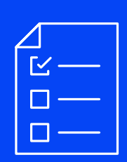
ACI Survey Data Integration