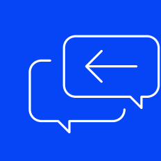
Real-Time Response Systems