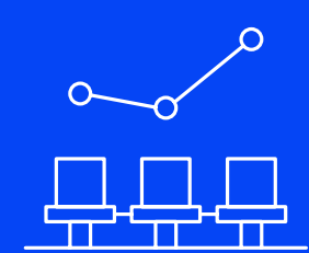
Gate Traffic Data