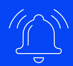
Digital Counters & Alerts