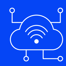
Internet of Things